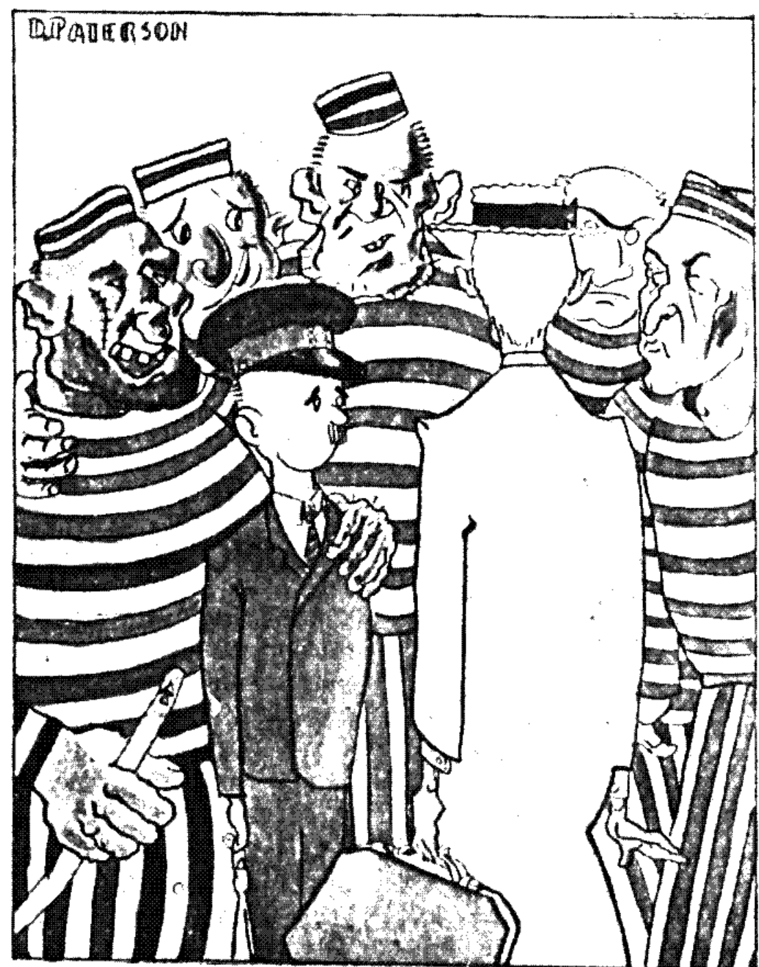
Have you seen the SALIENT Editor?

We trust those who remain will take a lesson from this meeting on how business should be conducted, whether there is general agreement or not among the members at the meeting on any particular point.