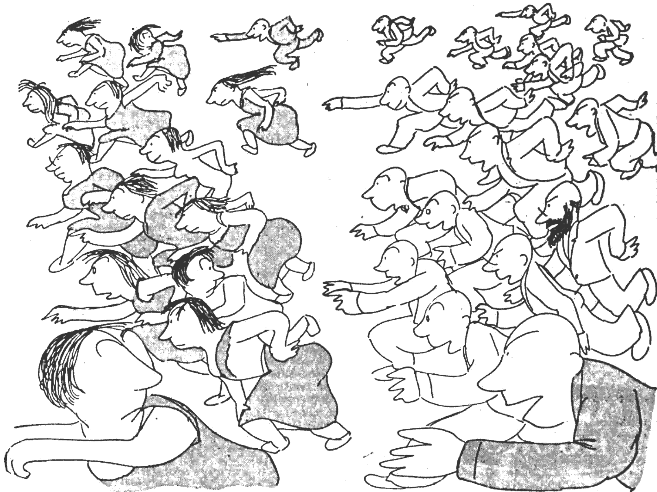
Don't forget Winter Tournament at O.U.