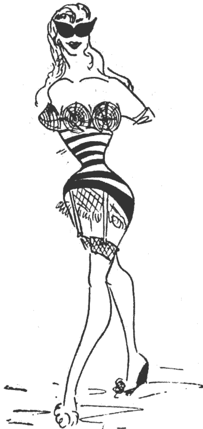
Getting ready for Art Festival?

stake, teams from the four universities and two agricultural colleges competing.