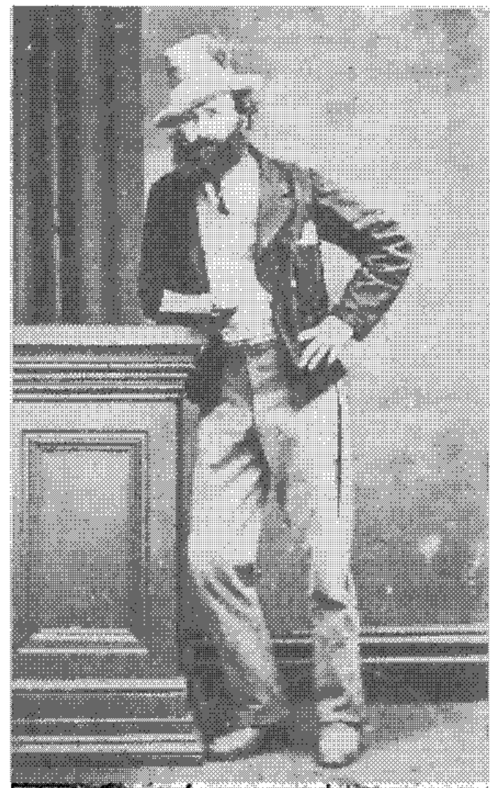
Retired President speaks.

When it was introduced there were only about 1500 students and it proved most satisfactory, but I do not think that it can be fully or efficiently geared to a student population of over 3000. For this reason I hope the Association will introduce the new portfolio system in the very near future.